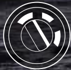
Shift-On-The-Fly 4-Wheel Drive*