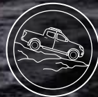
Hill Descent Control*