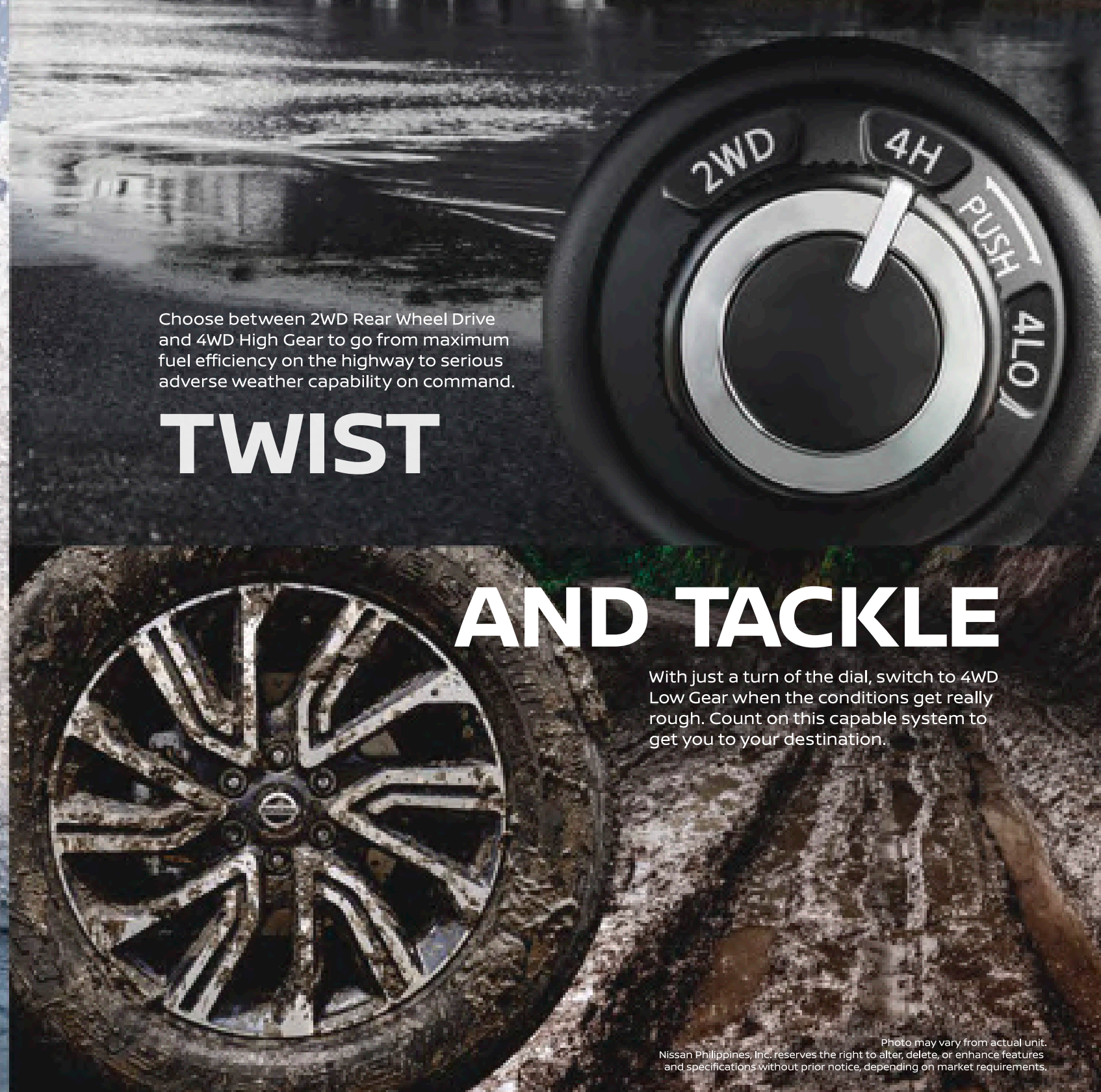
Photo may vary from actual unit. Nissan Philippines, Inc. reserves the right to alter, delete, or enhance features and specifications without prior notice, depending on market requirements.

With just a turn of the dial, switch to 4WD Low Gear when the conditions get really rough. Count on this capable system to get you to your destination.