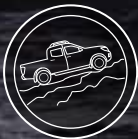
Hill Start Assist*

*Available in 4x4 EL and 4x4 VL variants