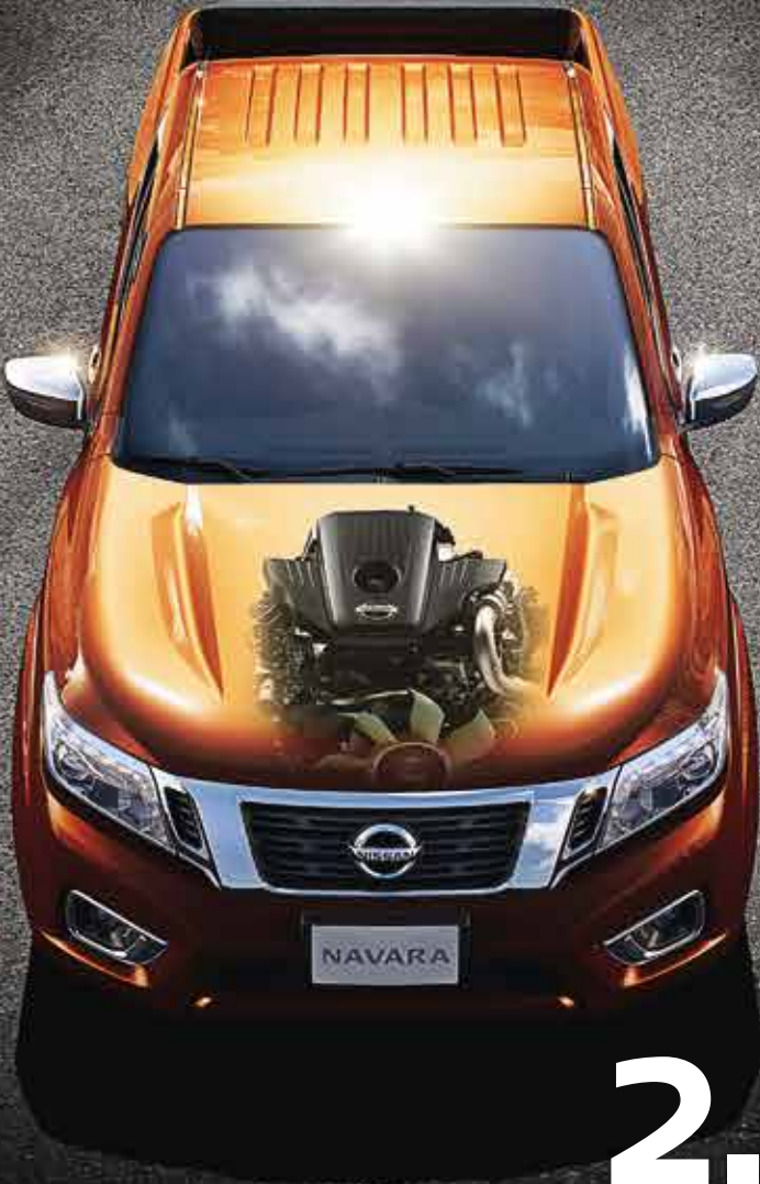
Photo may vary from actual unit. Nissan Philippines, Inc. reserves the right to alter, delete, or enhance features and specifications without prior notice, depending on market requirements.

*Available in EL Calibre, 4x4 EL, and 4x4 VL variants