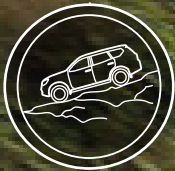
Hill Descent Control

All roads aren't created equal. That's why the Terra's Intelligent 4x4 System is designed to handle nearly any kind. Add in the Hill Descent Control and 4-Wheel Active Brake Limited Slip (ABLS) that senses wheel spin and automatically redirects power to the wheels with grip for plenty of help in conquering the roughest terrain.