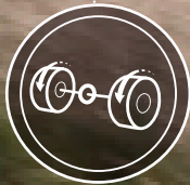
Electronic Locking Rear Differential