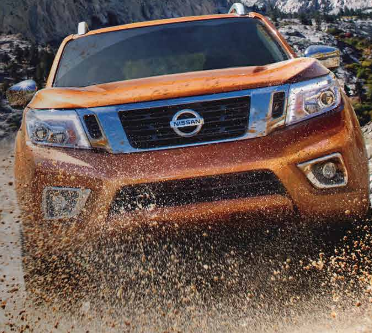
Photo may vary from actual unit. Nissan Philippines, Inc. reserves the right to alter, delete, or enhance features and specifications without prior notice, depending on market requirements.

We've been building strong, dependable pickups longer than you've been driving them. At every turn, we've ridden the edge of innovation to deliver a tested and proven fully boxed frame, a world-class engine, and a go-anywhere 4x4 command. Now, it's time to experience the excitement of the next generation of trucks where a heritage of tough meets premium ride comfort, smart technologies, and sleek, modern styling. The Nissan Navara takes you from a day on the job straight to a night on the town without missing a beat.