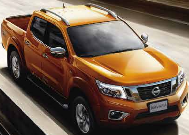
Photo may vary from actual unit. Nissan Philippines, Inc. reserves the right to alter, delete, or enhance features and specifications without prior notice, depending on market requirements.

What if the most rugged pickup in the off-road could ride as smoothly as most sedans do on the highway? Load up your family or grab a few friends and find out. Experience the smooth and comfortable ride that comes with a double-wishbone front suspension and a 5-link rear suspension. With its 7-speed automatic transmission, it's as capable in the off-road as it is smooth on the paved ones while being fuel-efficient. So go ahead and detour with confidence.