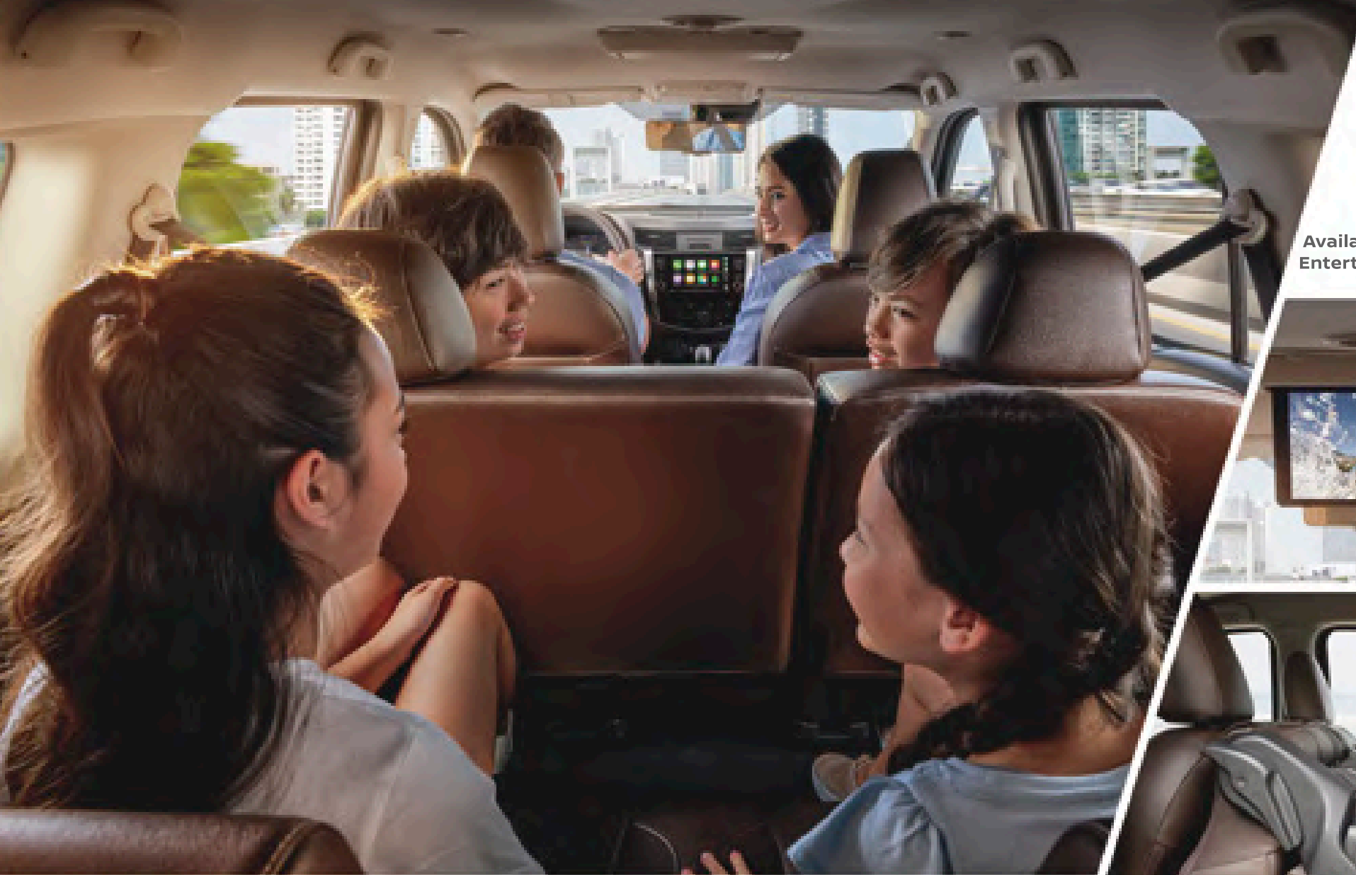
Available Flip-Down Rear Entertainment System