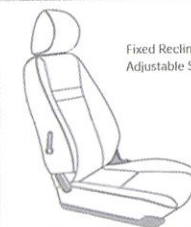
Fixed Recliner; Adjustable Slide

6-speed manual transmission Mated to the 2.5L engine, the all-new six-speed is noticeably quieter. Most importantly, the fifth and sixth overdrive gears will help conserve fuel and reduce your driving expenses.